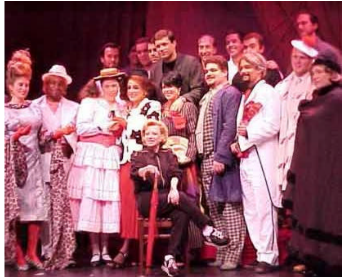
Cast of Viva La Mamma in Rio